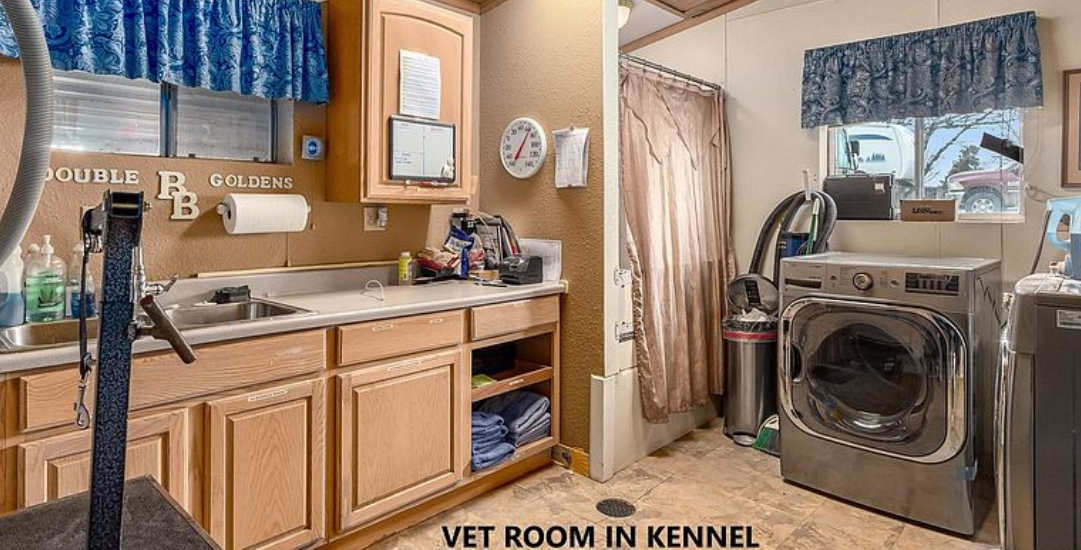
VET ROOM IN KENNEL